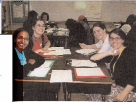
Stories and Works in Progress by Open Books' WeWrite Students February-March 2009